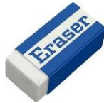
Eraser- ₹ 2.50

Prepare a bill for the following stationary items and find the total amount to be paid.